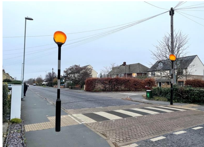
Location B: crossing from between Nos. 73/75 to No. 70

The committee surveyed people by distributing a paper flyer to 156 households, 5 businesses and 1 church, delivered door to door. It asked them to vote online for or against the proposal and to tell us why they voted as they did. Paper survey forms were also delivered to the 62 residential flats in Havenfield.