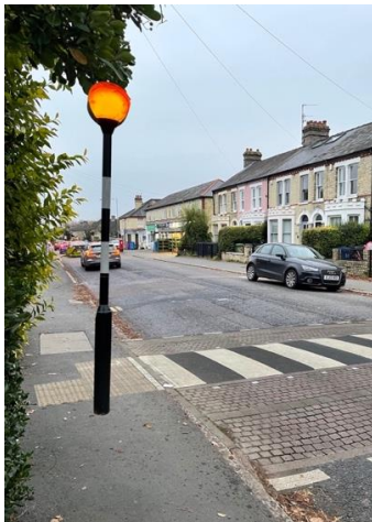
Location A: crossing from between Nos. 13/15 to the footpath to Kirkby Close

Two locations for a new crossing were suggested.